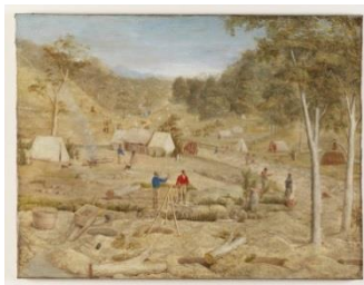
The Gold Rush

In addition to learning activities tailor-made for classroom use, other important areas of the website for teachers and students include: