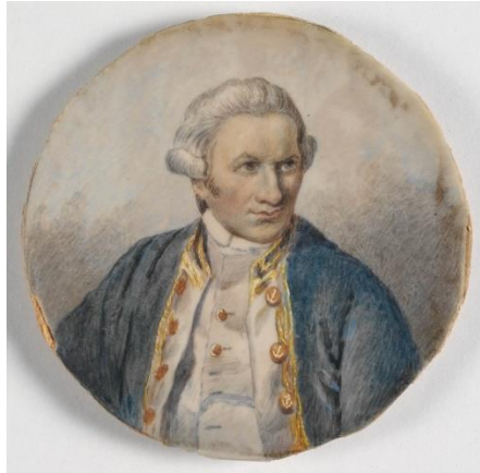
Captain James Cook - watercolour on ivory miniature in circular frame, ca. 1780-1784, a128550