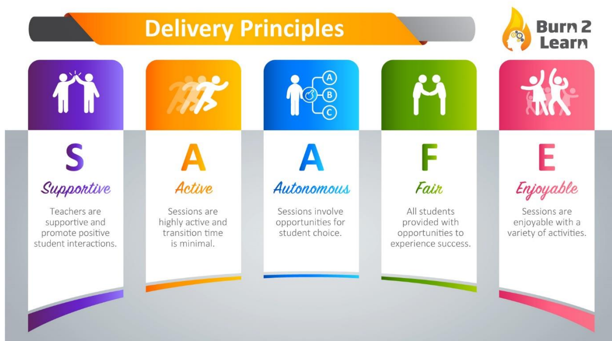
Figure 3: SAAFE principles for Burn 2 Learn session delivery

The introductory seminar reinforces the importance of exercise for cognitive health and academic performance. Competence is satisfied using positive and specific feedback from teachers, an explicit focus on effort over absolute performance (via heart rate feedback) and through the provision of resources designed to support the development of exercise skills. Finally, teachers are encouraged to adopt practices that support relatedness and group cohesion during HIIT sessions (for example, encouraging supportive behaviour among students such as 'high fives' and partner work) (Owen et al., 2014).